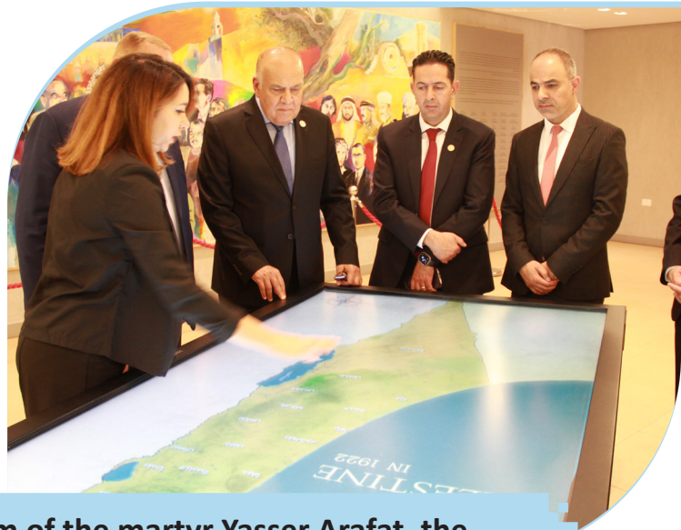
Visiting the mausoleum and museum of the martyr Yasser Arafat, the blessed Al-Aqsa Mosque, the Dome of the Rock, the Ibrahimi Mosque, and the Church of the Nativity and the Holy Sepulchre