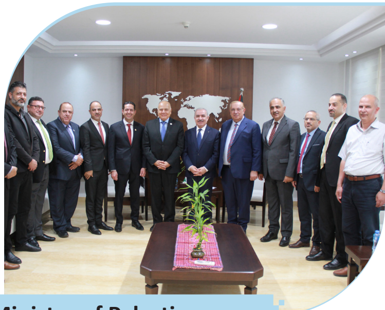
A visit by the Prime Minister of Palestine, Dr. Mohammad Shtayeh