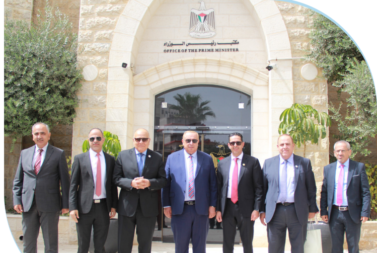
A visit by His Excellency the Minister of Higher Education and Scientific Research, Dr. Mahmoud Abu Mouis