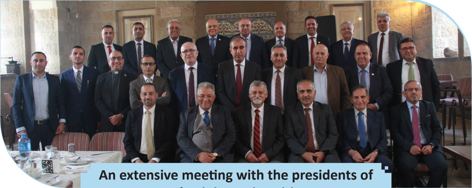
An extensive meeting with the presidents of Palestinian universities